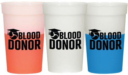
Color changing cups, 2 color options available, while supplies last.